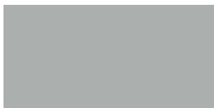
Goosewing Grey 222